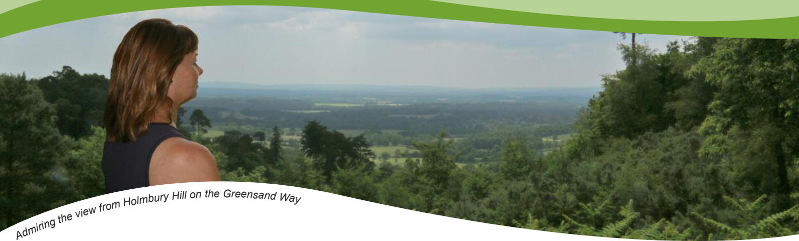
Admiring the view from Holmbury Hill on the Greensand Way