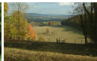
Before and after – views at Gatton Park

The Surrey Hills Inspiring Views Project was established in 2003 with funding initially from the Countryside Agency (now Natural England) and the National Trust.