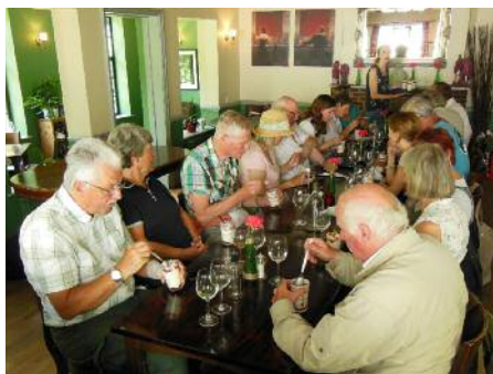
Presidents Day lunch at the Stephan Langton

Luckily I have managed my waist line by fitting in a number of interesting guided walks including Compton, Peaslake and