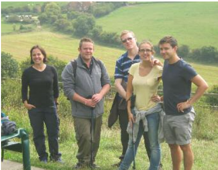
Views from Pewley Down

I recently went walking for the first time in Guildford. I am new in the country (I come from Brazil), in the city and also to walking. My expectations were basically based on the walks of Jane Austen's characters and their long journeys through England's hills. I had a really good experience with the 20s to 30s group that I want to tell you about.