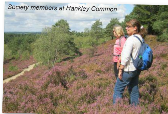
Society members at Hankley Common

plenty of paths for all to enjoy, giving open access all year round. The heather was at its best and the views were literally awe-inspiring.