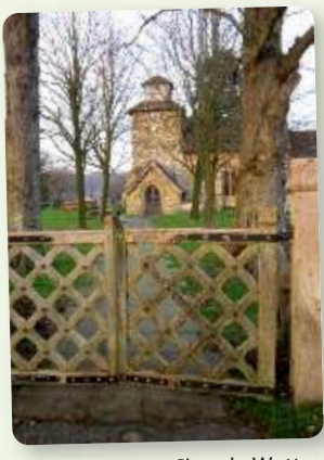
St Johns Church, Wotton Cath Friend