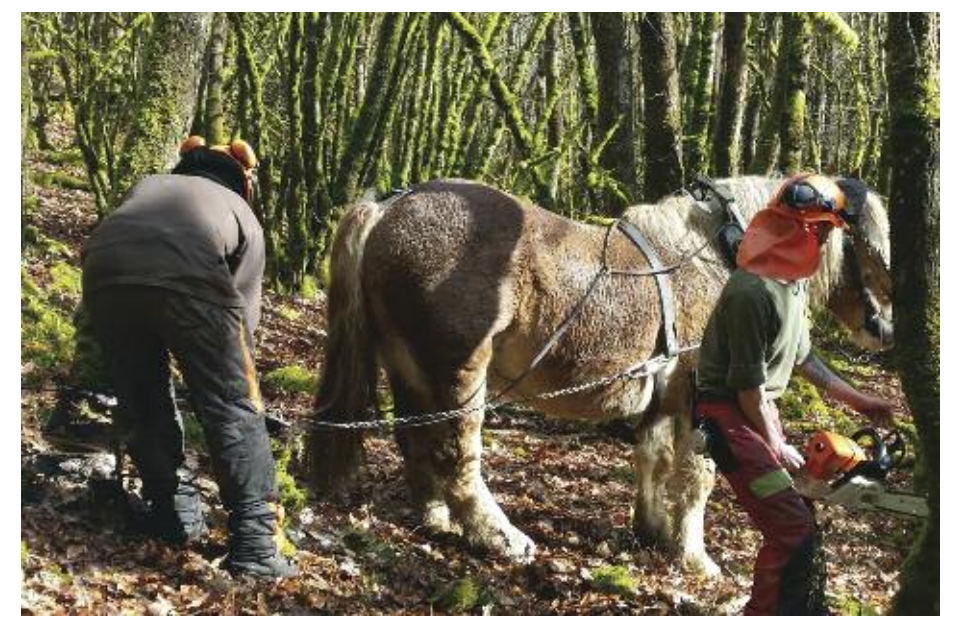
Traditional horse logging extraction methods in the publicly owned forest in Brittany.

In March this year, as the final piece of an 18 month project, representatives from Surrey Hills Enterprises and the South East of England attended a 4 day study trip to Brittany in France. With the objective of sharing knowledge, comparing situations and exploring commercial opportunities, we visited woodlands, processing businesses and educational facilities.