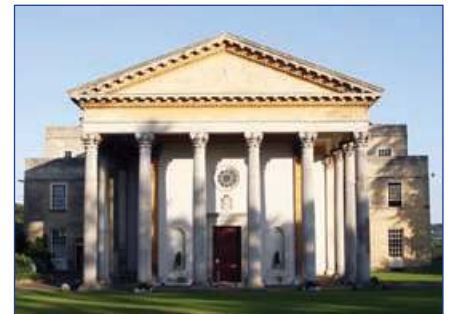
Views at Gaton Park, Reigate

the organising Parish Council. It gives the parish the opportunity to show off the very best of its heritage, history, countryside and community to an audience of like-minded people. Our recent visit to Brockham was a complete sell out and much enjoyed by all present, as you can read inside. This followed a similar successful visit to Shamley Green last year. I wonder where we will be going next; perhaps a parish in Waverley or Tandridge? If any members have ideas for future visits, we