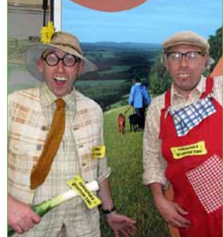
Loseley 'Grow Your Own' Event characters