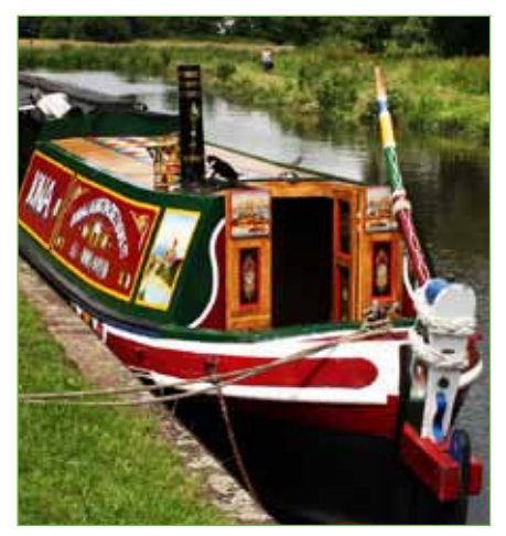
Narrow boat 'lona'

Editors Note: See website for write up of this event