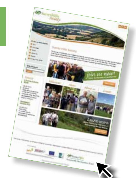
The new look website www.surreyhillssociety.org

Come and join me at the beginning of September to walk the Surrey section of the North Downs Way. We will be able to see the changes to the countryside as well as seeing the season change.