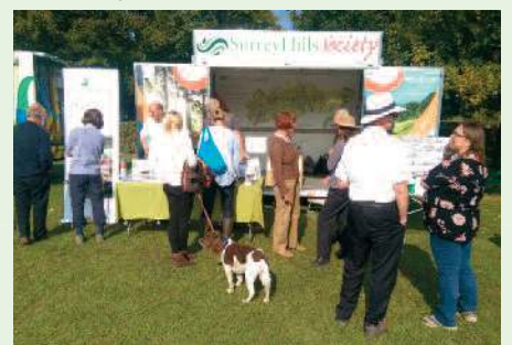
Surrey Hills Wood Fair October 2015

The Society has a promotional trailer and gazebo which are regular attendees at a range of external shows across the county. We have been to village fetes and other gatherings with a local focus and had a major presence at larger events such as the County Show, Surrey Hills Wood Fair and the enormous event at Denbies during the 2012 Olympics cycle race. Through these events we have introduced many thousands of people to the AONB and distributed walks leaflets and other information to help the public learn about, appreciate and enjoy the Surrey Hills.