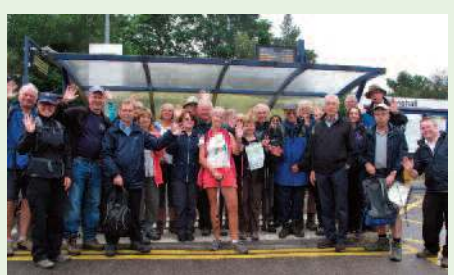
Guildford WalkFest walk in July 2016

In 2015 the Society was invited to host a walk as part of the Guildford WalkFest. We took up the offer and designed a 9 mile walk around Shere, Gomshall, Albury and Peaslake based upon the Shere Millennium Trail. The walk was a great success with many non-members taking part and learning about the area. We understand that it was one of the most heavily subscribed walks of the whole programme. We are now booked to do several walks for the 2016 WalkFest!