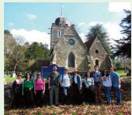
Walk for younger audience in Shere April 2015

Having established the Society, it became apparent that we were not engaging sufficiently with people in their 20's and 30's. This was partly due to the timing of our events and also because our walks tend to be short, themed, events at a relatively slow pace. To attract younger people, we have set up a programme which provides a walk on the first Sunday of every month specifically targeted at non-members and those who prefer a brisker pace. Using social media to spread the word and making the walks free has opened up the Surrey Hills to younger people who just needed a suitable mechanism to help them to get out and explore. If you are interested, check out the programme on the back page.