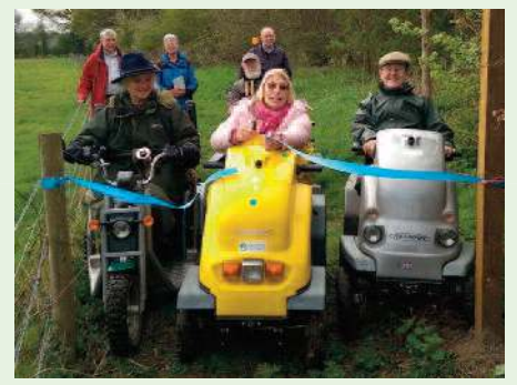
HCPS walk relaunch April 2015

Several of our members also belong to Horsley Countryside Preservation Society (HCPS). Their organisation had established a 9 mile walk around the Horsleys and as part of the Queens Diamond Jubilee celebrations, the route had been upgraded to make it accessible to off-road mobility vehicles and pushchairs etc. Their map leaflet needed updating and reprinting. The Surrey Hills Society organised and paid for the print run and donated the majority of the leaflets to HCPS – retaining the balance to hand out from SHS promotional displays – so that the walk became accessible to a wider audience.