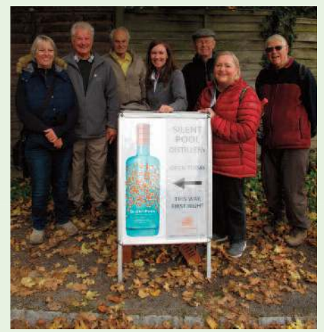
SHS members visiting Silent Pool Gin distillery

The Surrey Hills are home to a vibrant local food and drink producing industry. Many of these are small artisan producers of very high quality products. One of their major constraints is promotion to the public. We have noted through the years that events with local food and drink are always heavily subscribed. Consequently, we have used our events programme as a platform to help our members discover local food and hence act as customers and ambassadors for the producers.