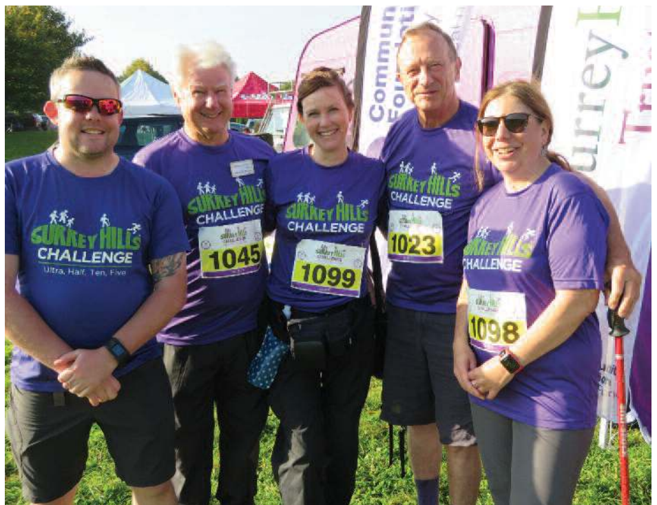
SHS Members fund raising for Surrey Hills Trust Fund in Surrey Hills Challenge event at Denbies