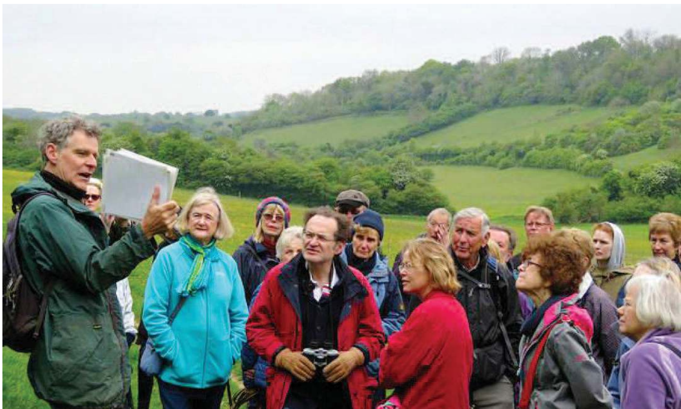
SHS members learning about countryside management in Happy Valley, near Coulsdon