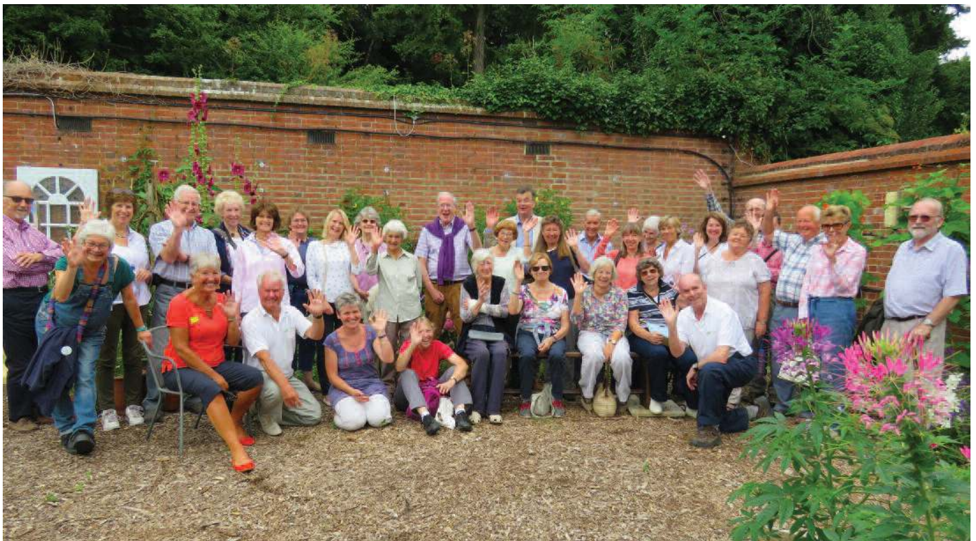
SHS Members at Patchworking Garden Project

This may appear a strange coupling for the Surrey Hills, but it is an excellent project that has been developed in the old SITA sandpit/refuse centre in Albury, at the base of Newlands Corner. Again, the networking value of the Society was demonstrated when, after our visit to GASP, one of our members donated a significant sum towards their project which teaches teenagers basic motor engineering skills.