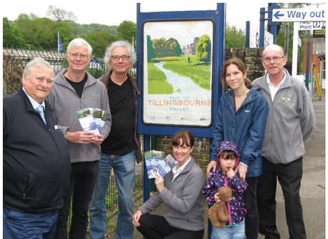
Launching the Tales of the Tillingbourne walks with Great Western Rail.