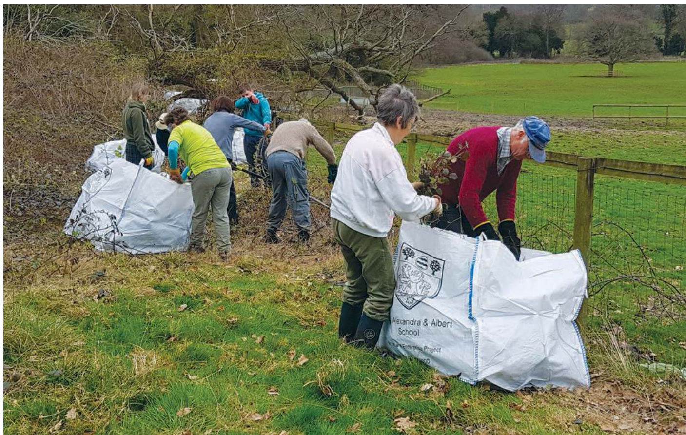
SHS Volunteers working at Gatton Park, near Reigate