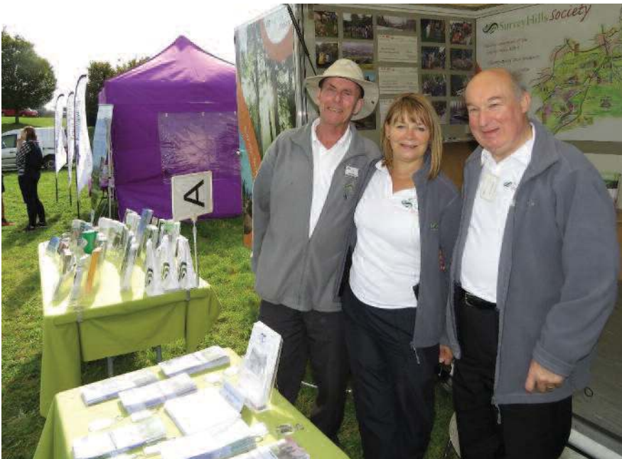
Volunteers manning our stand at Surrey Hills Challenge at Denbies September 2017

We very much value the contributions, however small or large, made by our volunteers and to mark this, a 'Thank you to the volunteers' picnic was held for the first time in August 2017.