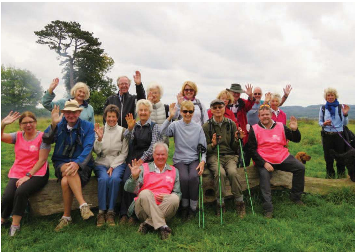
SHS volunteers leading on Guildford Walkfest Walk on Ranmore Common