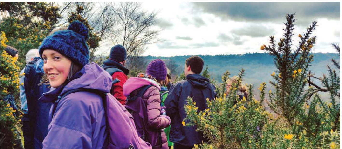
One of our wintry guided walks