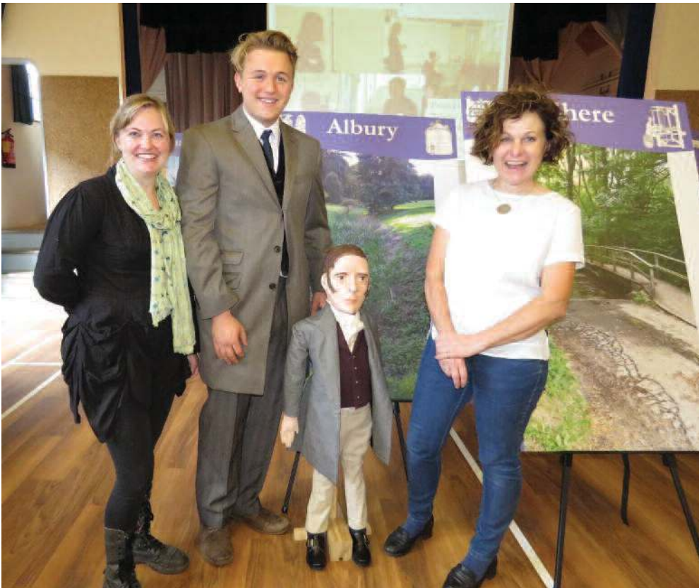
Members of the Tales of the Tillingbourne project team with one of the puppets at launch event in Shere

We are grateful for sponsorship from Fidelity International.