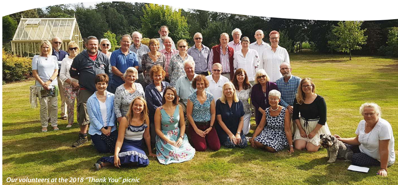
Our volunteers at the 2018 "Thank You" picnic

We hope that you have enjoyed reading about some of the activities of the Surrey Hills Society during its 10th anniversary year. The Society is continuing to grow in size and stature as it seeks to involve a wider audience across the area.