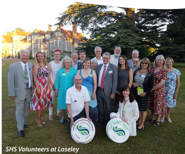
SHS Volunteers at Loseley