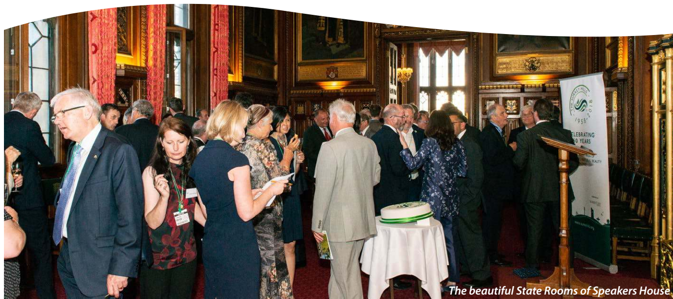
The beautiful State Rooms of Speakers House