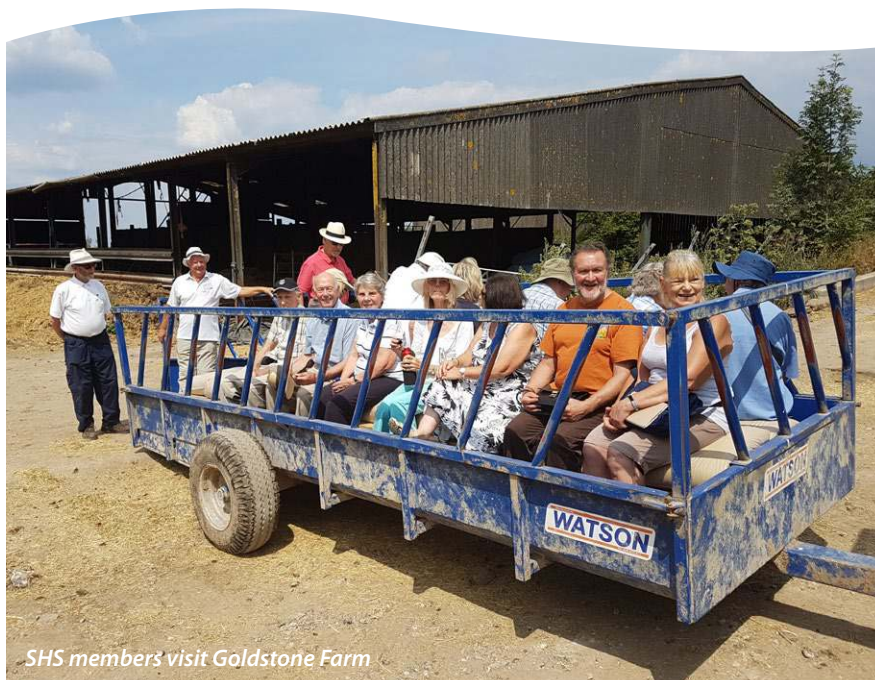
SHS members visit Goldstone Farm

Due to this high level of volunteering, all the monies received by the Society, whether from internal activities, external grants or donations can (apart from internal running costs) be used to support the outreach and wider goals of the organisation as described in the Charity's Aims.