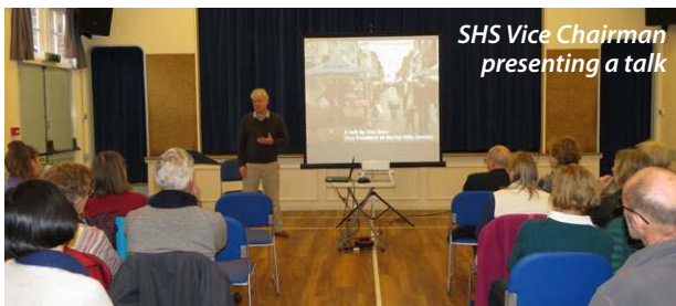
SHS Vice Chairman presenting a talk