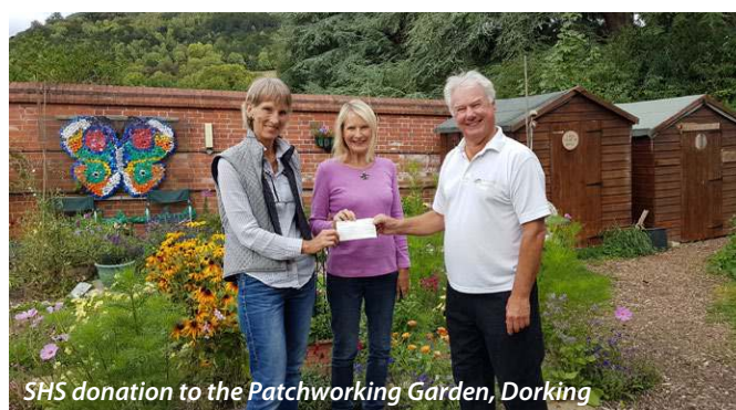
SHS donation to the Patchworking Garden, Dorking