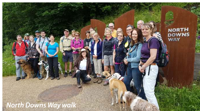
North Downs Way walk