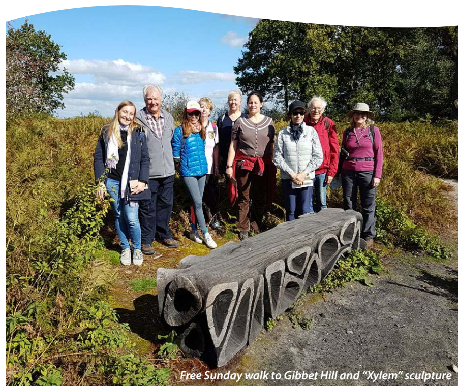
Free Sunday walk to Gibbet Hill and "Xylem" sculpture