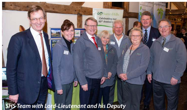
SHS Team with Lord-Lieutenant and his Deputy

We were invited to participate in a major promotion at Loseley House in the presence of the Lord Lieutenant, and many other influential members of the community. [Note: Since year end, we have been informed that we have been selected to receive the Award and the presentation will occur in the Autumn of 2019].