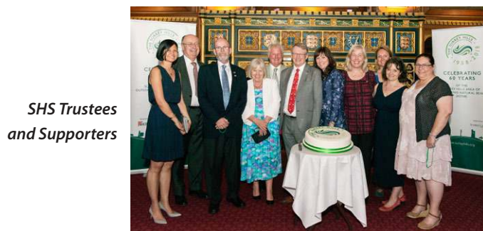
SHS Trustees and Supporters