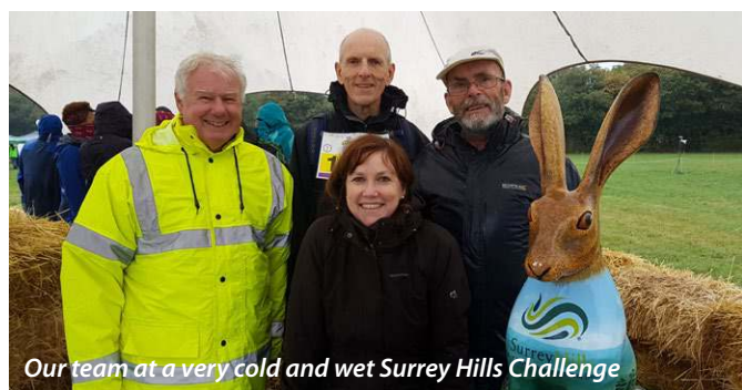
Our team at a very cold and wet Surrey Hills Challenge