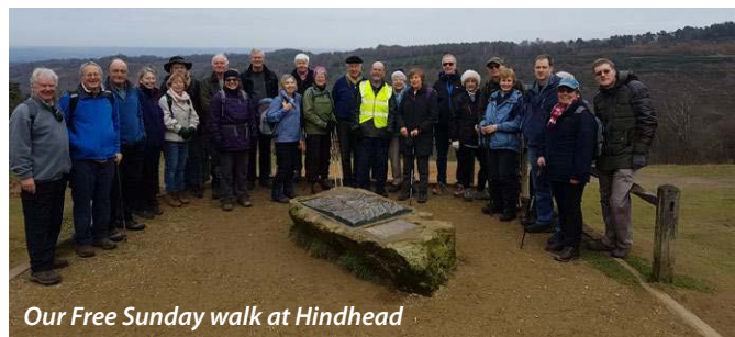
Our Free Sunday walk at Hindhead