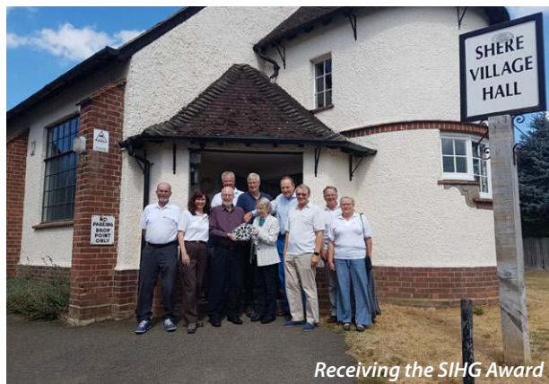
Receiving the SIHG Award