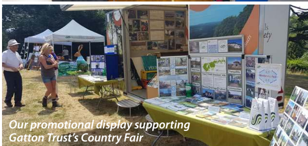
Our promotional display supporting Gatton Trust's Country Fair

During 2018 to 2019 there were more than 70 active volunteers supporting our Society in various ways. They undertake a wide range of tasks including practical volunteering, newsletter compilation and packing, supervising events, sitting on committees as well as external promotion of the Society.