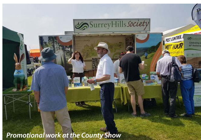
Promotional work at the County Show

We very much value the contributions made by our volunteers to achieve such a wide ranging programme and, to mark this, a 'Thank you to the Volunteers' picnic was held in August 2018.