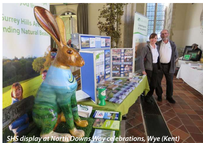
SHS display at North Downs Way celebrations, Wye (Kent)